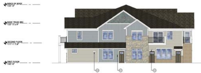
② WEST ELEVATION 1/8" = 1'-0"