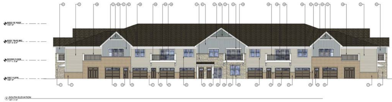
① SOUTH ELEVATION 1/8" = 1'-0"